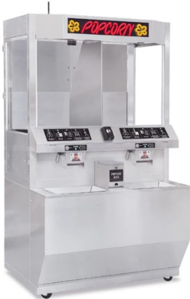
Self-Serve Popcorn Dispenser