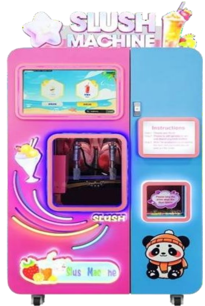
Self serve slush Vending Machine