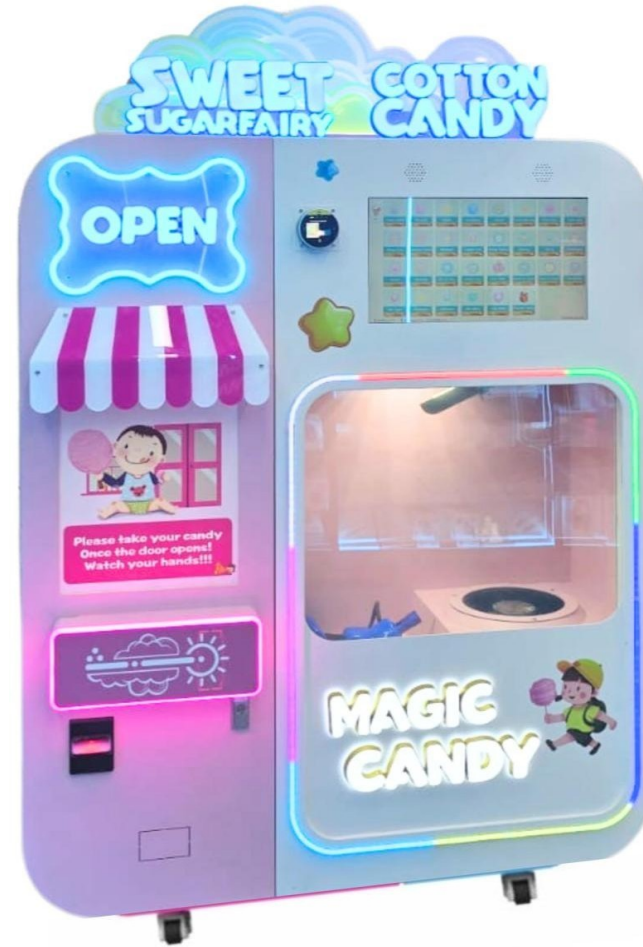
Cotton Candy Vending Machine