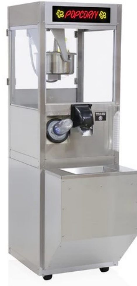
ReadyPop Popper & popcorn dispensing machine